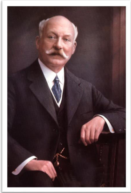
John G. Robinson, Chief Mechanical Engineer of the Great Central Railway.