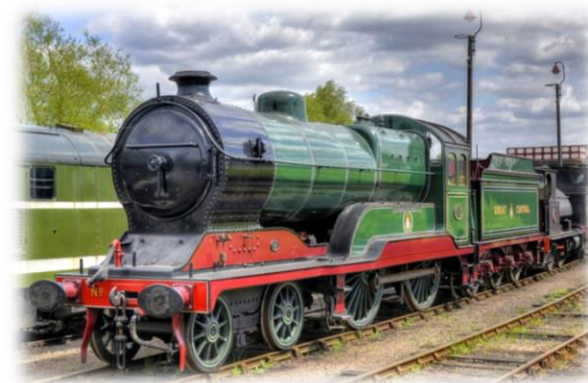
Preserved GCR class 11F ('Improved Director') 4-4-0 no.506 Butler-Henderson at Barrow Hill Roundhouse.

Joint Lines: MSJ&AR, CLC, SYJnt and others