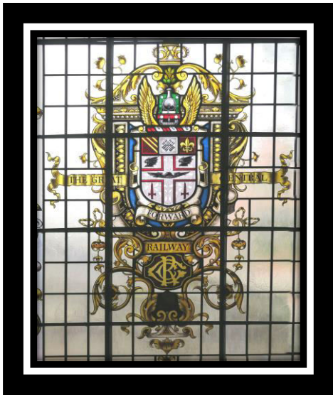
Window at the Marylebone Hotel depicting the GCR coat-of-arms.

The map is made up of • the original MS&LR system. • the jointly owned Cheshire Lines. • the London Extension. • other joint lines.